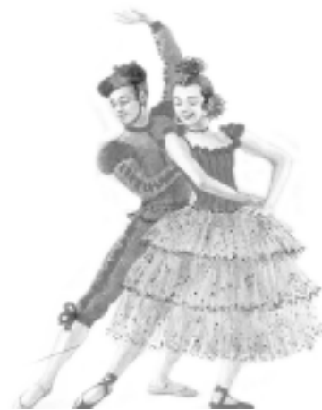
Spanish chocolate dance

Herr Drosselmeyer's magic tricks, dancing dolls appear. Clara receives a nutcracker.