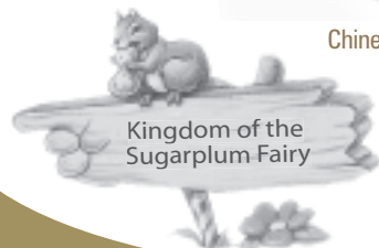
Kingdom of the Sugarplum Fairy

The sleigh brings Clara and the Nutcracker Prince to the Land of Sweets. Here the Sugar Plum Fairy presents an assortment of her "sweets" to thank Clara and the Prince. The entertainment includes the Spanish chocolate dance, Arabian coffee dance, Chinese tea dance, Russian dancers, French marzipan dancers, Mother Ginger and her Bon Bons, and the Waltz of the Flowers. The Sugar Plum Fairy then dances a special dance, after which the entire court joins her in a final dance.