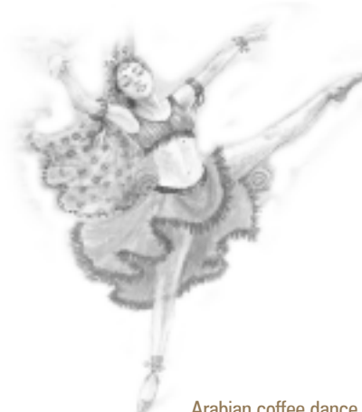
Arabian coffee dance

The nutcracker is transformed. He leads toy soldiers into battle against the Rat King.