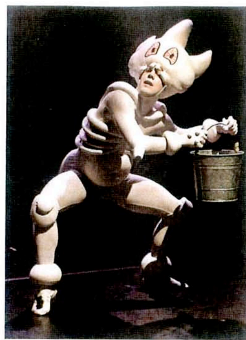
Sesom dancing.