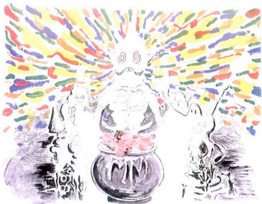
Hancock: St. Sesom and the Cult of Color, 2005, mixed mediums on paper, 8 1/4 by 10 inches. Courtesy James Cohan Gallery, New York.